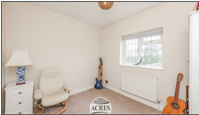
Slade Road, Sutton Four Oaks, Sutton Coldfield, B75 5PE